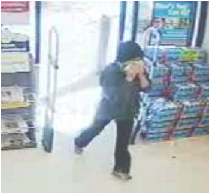
SCOTTSDALE ROBBERY (5/4/10)