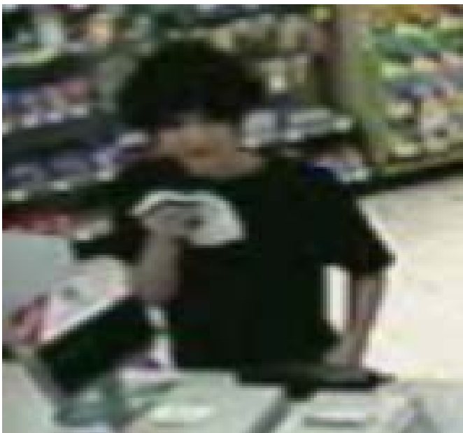
GILBERT ROBBERY (5/23/10)