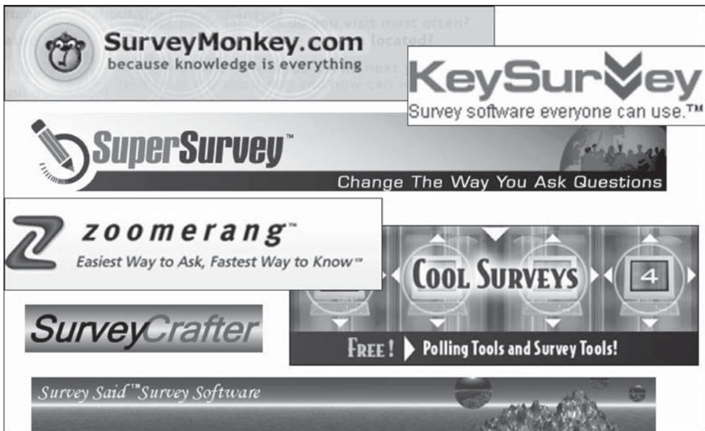
Figure 11.2 Banners for various Internet survey software (accessed January 2007)

There are many ways to draw samples from a population – and there are also many ways that sampling can go awry. We intuitively think of a good sample as one that is representative of the population from which the sample has been drawn. By ‘representative’ we do not necessarily mean the sample matches the population in terms of observable characteristics, but rather that the results from the data we collect from the sample are consistent with the results we would have obtained if we had collected data on the entire population.