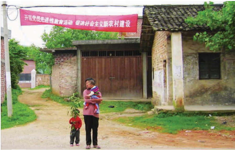
PICTURE 1. The picture with a slogan: 'Conducting Advanced Education Activities of the CCP to Improve Socialist New Countryside Construction' on the banner

What we found is that in each of these cases, rather than concealing them, all three journalists revealed deep social conflicts and clarified the negative mood of the people toward government as a result of social inequalities and governmental failures in their reports submitted to the editor's desk. They criticized the systematic problems within Chinese society as well as the local leadership. They criticized the over-emphasis on economic development in Chinese modernization that has led to the moral collapse of the rich and the loss of people's confidence in their governors. They also criticize the official-capital collaboration, local corruption and the failure of local government.